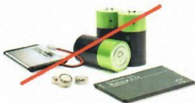
NO Batteries – check local drop-off programs for proper disposal NO baterías - Verifique los programas locales de entrega para su correcta eliminación