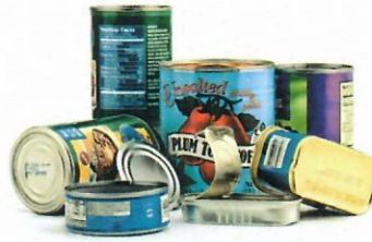
Food & Beverage Cans Latas de alimentos y bebidas