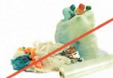
NO Loose Plastic Bags, Bagged Recyclables or Film Empty recyclables directly into your bin. NO bolsas y envolturas de plástico sueltas, o materiales reciclables embolsados Vacié directamente los materiales reciclables en nuestro carrito