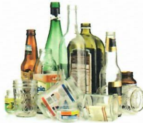
Glass Bottles & Containers Botellas y envases de vidrio

✗ DO NOT INCLUDE IN YOUR MIXED RECYCLING CONTAINER / NO INCLUIR EN SU CONTENEDOR DE RECICLAJE MIXTO