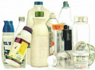
Plastic Bottles & Containers Botellas y envases de plástico