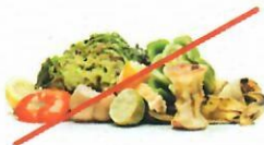
NO Food or Liquids NO comida o líquidos

✗ DO NOT INCLUDE IN YOUR MIXED RECYCLING CONTAINER / NO INCLUIR EN SU CONTENEDOR DE RECICLAJE MIXTO