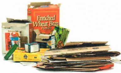
Flattened Cardboard & Paperboard Cartón y cartulina aplastados