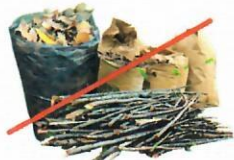
NO Green Waste NO desechos verdes