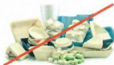
NO Foam Cups & Containers NO vasos y recipientes de poliestireno