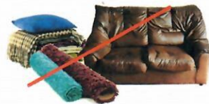
NO Clothing, Furniture & Carpet NO ropa, muebles y alfombras

To learn more, visit: Para más información, visite: wm.com/recycleright